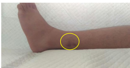
Figure 2. Clinical photograph showed that the donor site was slightly bulging after surgery

without significant foot and ankle problems. Furthermore, the function of the foot and ankle returned to normal in three months after surgery which is shown by all score criteria.