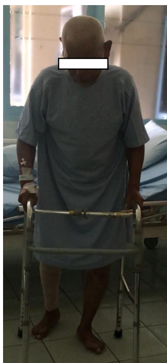
Figure 2. Post-operative outcome of a patient on day 3