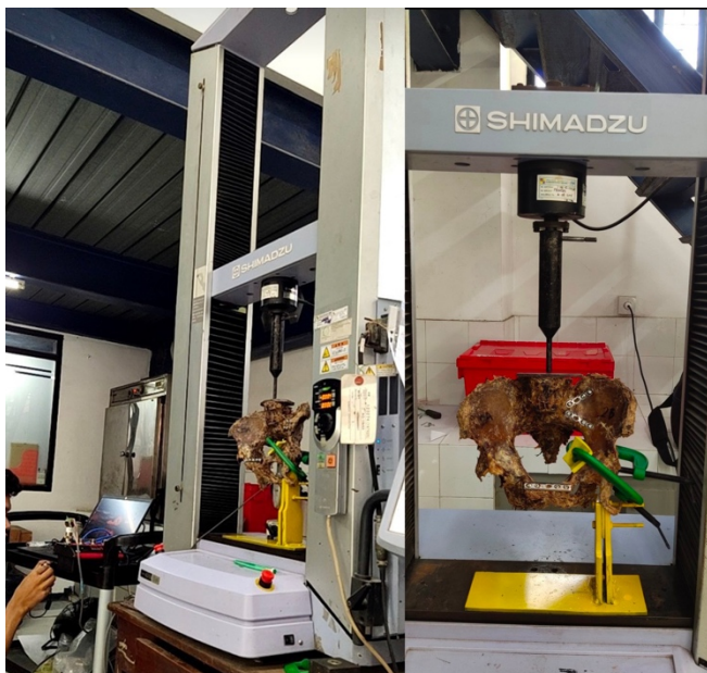
Figure 2. Biomechanical Testing of Cadaveric Pelvic Bone Using Autograft. A particular holder device was made to fix the pelvic during the experiment.